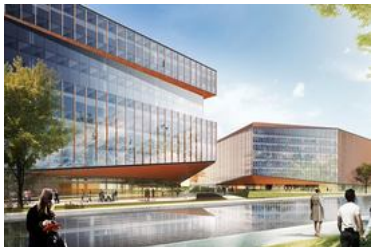
KPF Breaks Ground on Parc du Millénaire Ministry of Justice Building in Paris >