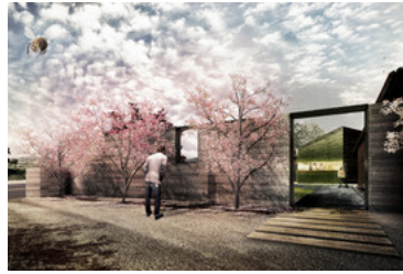
Snøhetta and Envelope A+D Design French Laundry Expansion >