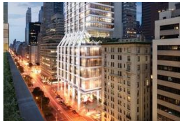
Foster + Partners Wins Competition for New Tower at 425 Park Avenue in New York >