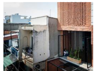
Wasp House > Tropical Space C