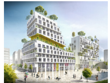
ZAC Rive Gauche > SeArch, A Phileas, LA Architectures