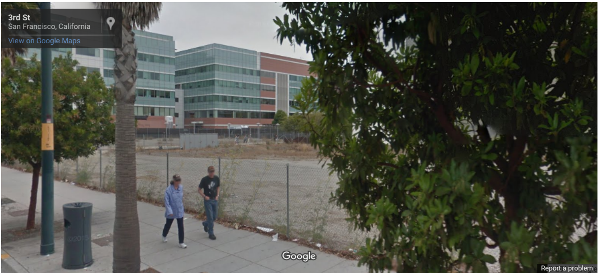
The Mission Bay site as of March 2014.