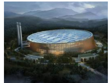
Shenzhen East Waste-to-Energy Plant > Schmidt Hamme Lassen Architects, Gottlieb Paludan Archi