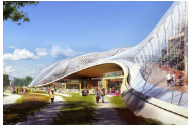
Google Finds New Mountain View, Calif., Site for Its Headquarters >