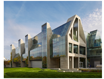
Gordon Parks Arts Hall >