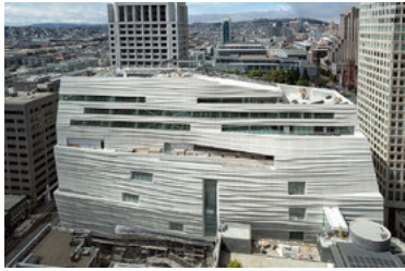
Expanded San Francisco Museum of Modern Art Will Open in May 2016 >