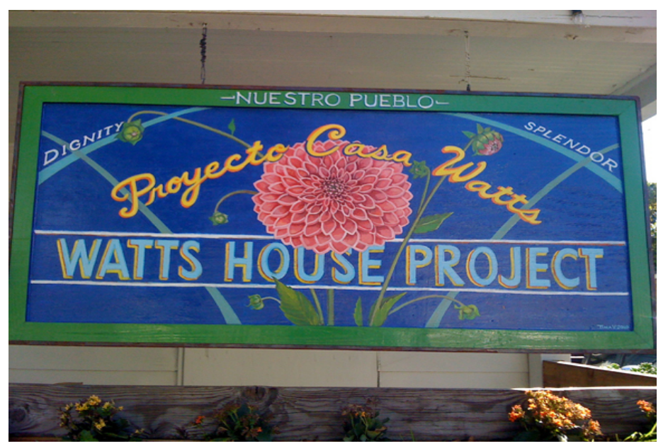
Watts House Project.