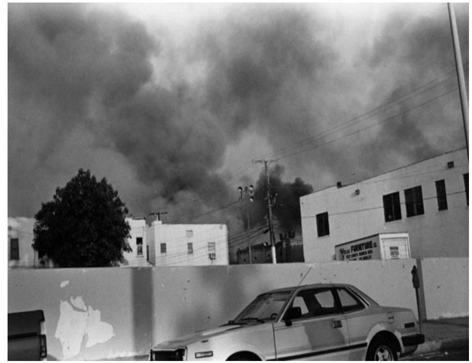
"Buildings Burning During 1992 L.A. Riots"

I got involved with Art on Saturday in 1994, and the riots had happened in '92, so it was a few years before. My family had left Los Angeles in 1986. We moved to West Covina in San Gabriel valley. I remember watching the city on fire from that distance and we lived slightly on a hill so I could literally see the plumes of smoke rising. And a good portion of my family is still there--my aunts, my cousins, I mean everybody was still in there. And the four freeways around the city had sort of more or less become the boundaries by which everyone was being contained. There really was no place to go if you were stuck in South Central when the uprising had begun. And there was a tremendous sense of helplessness that I felt in that process and also completely confused as to watching people sort of burn their own space. Like, why don't you go to the more affluent neighborhoods?