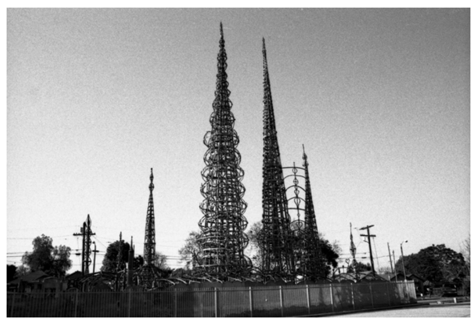
"Watts Towers - 2."

Simon Rodia's towers are interesting in a similar ways; they're sort of the creation of a micro-verse inside of his own backyard. These towers are composed of these beautifully mathematical dodecahedrons, polyhedrons, towers built inside of towers. He was a self-taught engineer. The tallest tower is 100 feet tall, and it is made up of the same sort of economy of means that has the same sort of beauty within the mathematics. Using the materials which is around him, a repurposing of the ecosystem which was there and also sort of telling a beautiful story in the process. It was really the testament to the will of the individual, what one person can do if they really commit to doing something great.