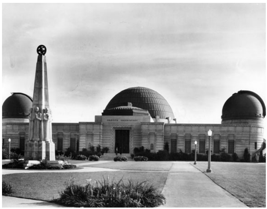
"Observatory in Griffith Park"

Simon Rodia's towers are interesting in a similar ways; they're sort of the creation of a micro-verse inside of his own backyard. These towers are composed of these beautifully mathematical dodecahedrons, polyhedrons, towers built inside of towers. He was a self-taught engineer. The tallest tower is 100 feet tall, and it is made up of the same sort of economy of means that has the same sort of beauty within the mathematics. Using the materials which is around him, a repurposing of the ecosystem which was there and also sort of telling a beautiful story in the process. It was really the testament to the will of the individual, what one person can do if they really commit to doing something great.