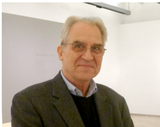
Luis Camnitzer.

And so began his complex argument for art thinking. “When we talk about art, we generally lump a great many things together, to the point where are knowing not exactly what we are talking about,” Camnitzer said, in his distinctly German-Uruguayan-American accent. “When I ask anybody, the response would be that there’s art-making and there’s art appreciation.” But he wanted to add a third group—art thinking.